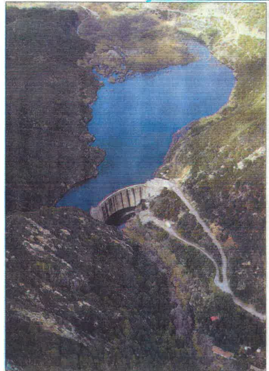
WATERWAY: Supporters say removing Matilija Dam would replenish Ventura's beaches and restore a historical breeding ground for steelhead trout in the upper reaches of the Ventura River.