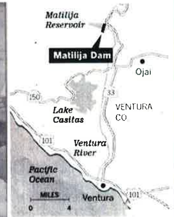
Los Angeles Times